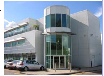
Multibuild's Head Office in Stockport

Latest client in the building and civil engineering sector is Multibuild, a Stockport-based company specialising in hotel and refurbishment work. We have been building a competencies framework for performance management and development.